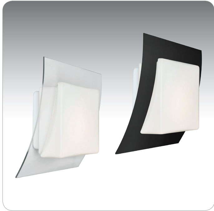
OPAL/CLEAR & OPAL/BLACK

UL or ETL Listed. Suitable for Wet Locations (interior or exterior use).