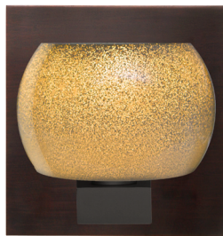
KENOWH WHITE SAND