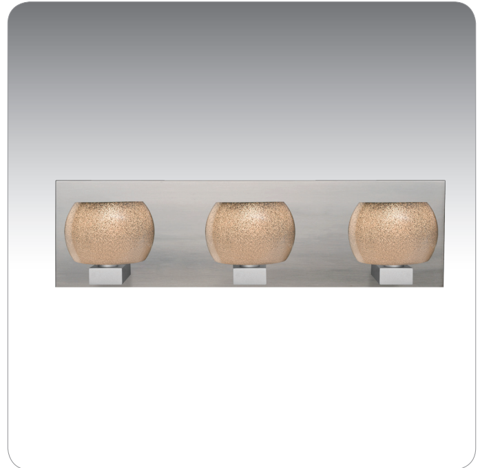
SMOKE SAND (KENOSM)

UL or ETL Listed. Suitable for Damp Locations (interior use only).